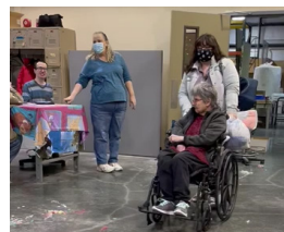
Fort Scott Welcome Back (on left)

We are very excited to have the Service Centers re-opened. There is light at the end of the tunnel that life will return to some semblance of the norm.