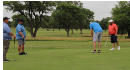
Golfers at the 2020 Fredonia Golf Tournament