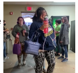
Chanute Welcome Back (on right)