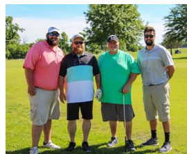
B Flight 1st Place I Can't Believe We're Not Putter Team