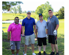
B Flight 2nd Place B & W #2 Team