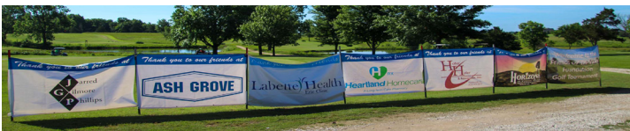
Thank you to our Corporate Sponsors.

We have three additional tournaments for 2022. First up is our Fredonia Tournament on Saturday, July 23rd. On August 20th, we will hold a tournament in Chanute at Stone Creek Golf Course. Finally, we will hold our annual Fort Scott tournament on September 10th at Woodland Hills Golf Course. We look forward to seeing you there!