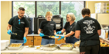
Staff from Dalton's Back 9 preparing the delicious entree.