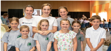
Our servers for the evening were from the Neosho Valley Busy Bee's 4H Club.

We look forward to seeing everyone in 2023.