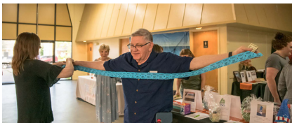
Our stretch auction included 11 baskets: including a lottery basket and gift certificates.