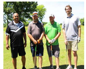
A Flight 2nd Place Works Team