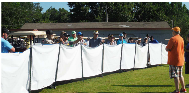
Listening to the rules of the day!