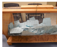
Here's what 1,767 tickets looked like before the winning ticket is

Turners are past entrants and are very excited about their new truck!