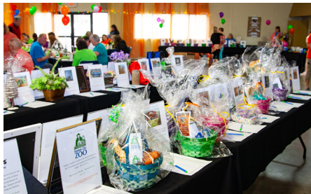
Our silent auction included trips, autographed items, home goods, and a variety of other unique items.

has built six homes split between Allen, Bourbon and Neosho Counties. They also own additional homes in Fort Scott and Chanute as well as a duplex in Chanute. These houses are home to forty-eight individuals with intellectual and developmental disabilities that are served by Tri-Valley Developmental Services, Inc.