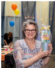
Once again, a stretch auction was included as part of the evening.