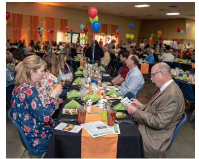
This year's color scheme was black, orange and green. Everyone enjoyed the food that was catered by Great Western Dining Services.