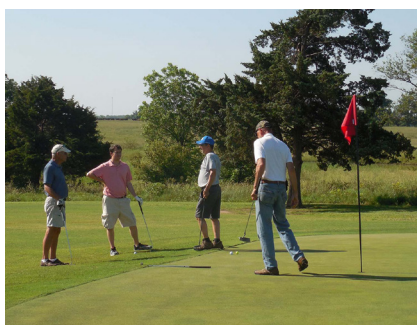
Wrapping up a hole!