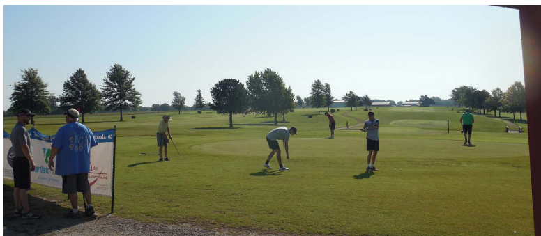
Putting around before the tournament starts.

Thank you to all the golfers who participated as well as to our event sponsors: corporate, hole, and in-kind. Without your kindness, this tournament would not have been possible.