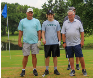
A Flight, 1 st Place