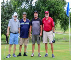
A Flight, 2 nd Place