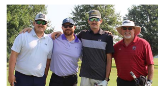
A Flight, 2 nd Place