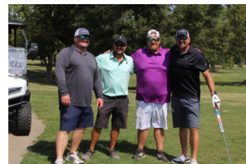
A Flight, 2 nd Place