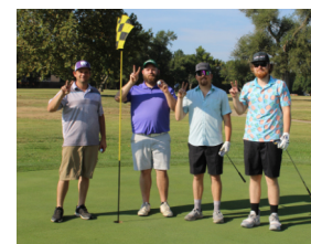
B Flight, 2 nd Place