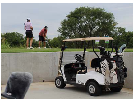
A few candid photos from the Chanute Golf Tournament held at the Stone Creek Golf Course.